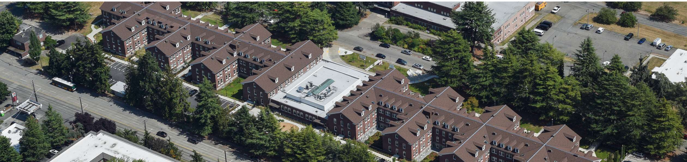
Mercy Magnuson Place | Seattle, WA