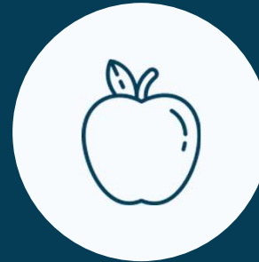
Out of School Time