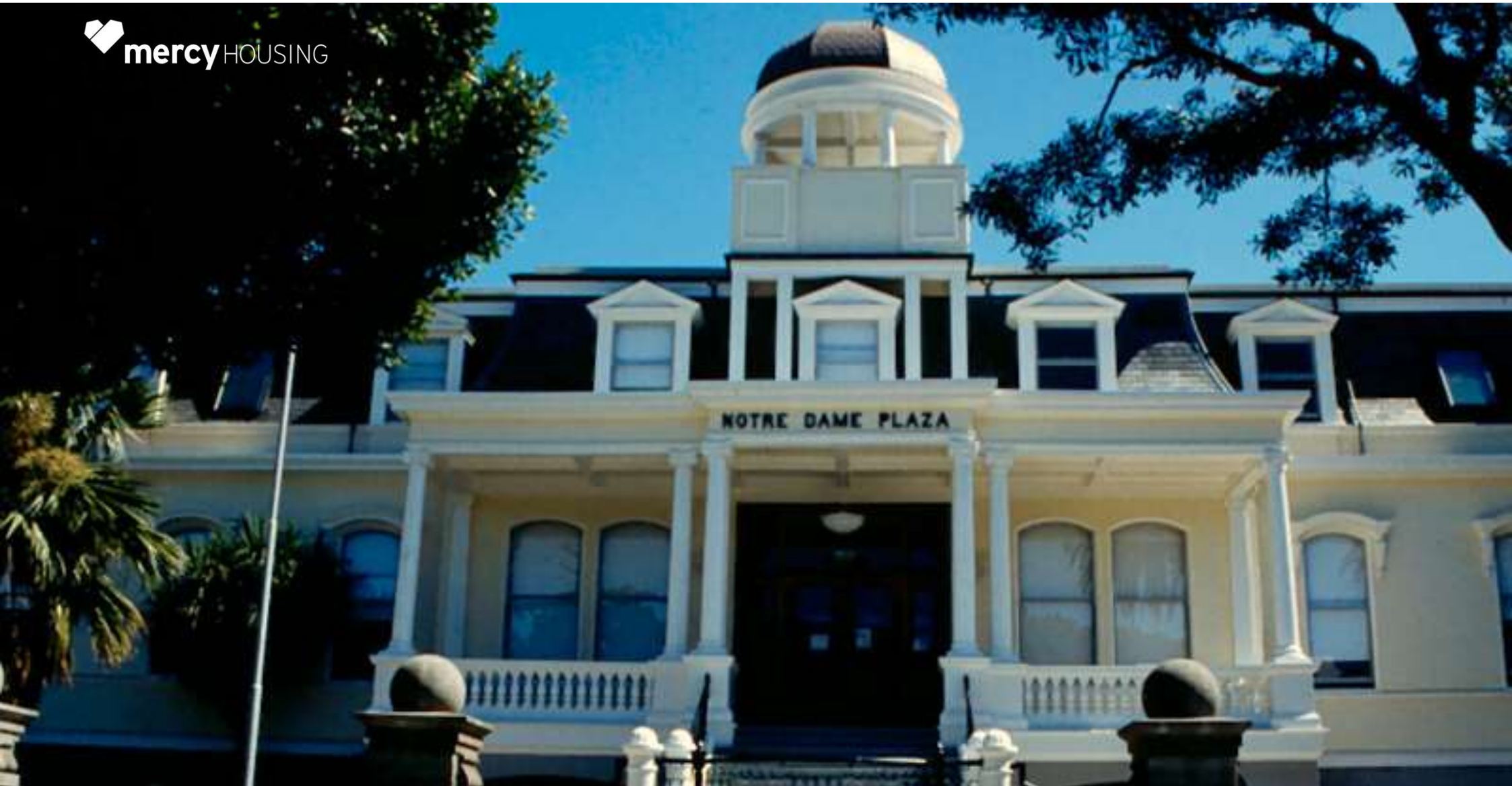
Notre Dame Plaza | San Francisco, CA