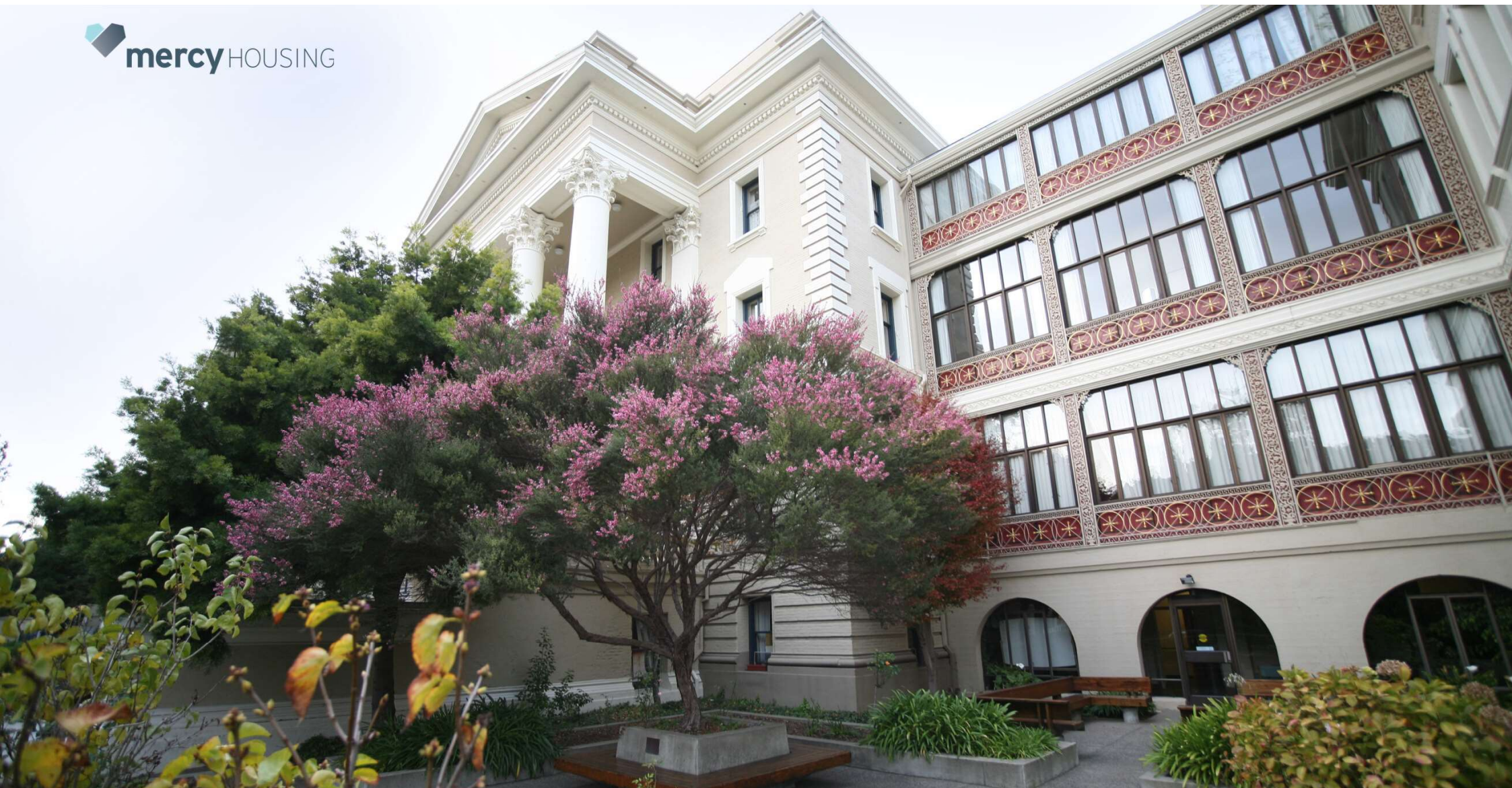
Mercy Terrace/Mercy Family Plaza | San Francisco, CA